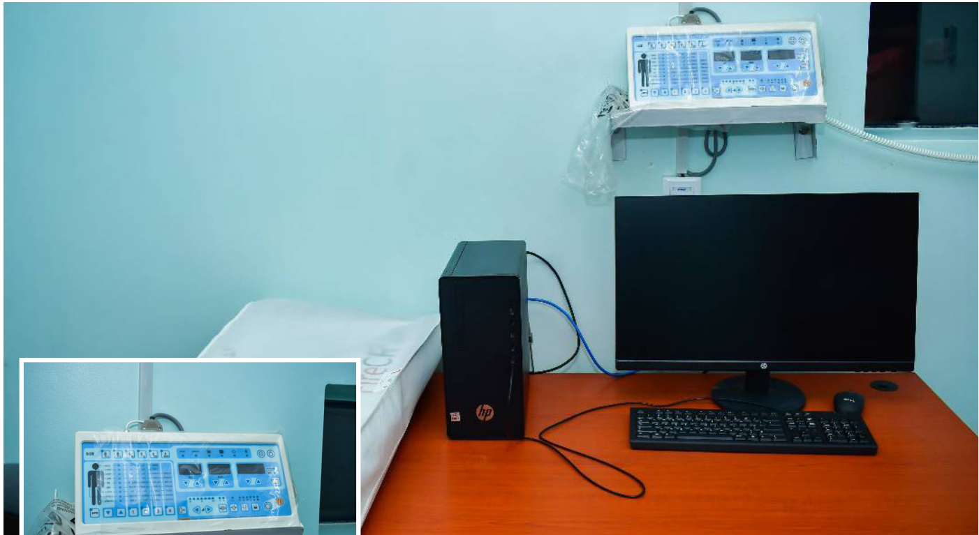
Above is the Control unit for the X-Ray that has a printer and CR unit.

The components on the Xray machines include; Fixed table, chest stand, main unit, Printer, CR System, Generator and a work station.