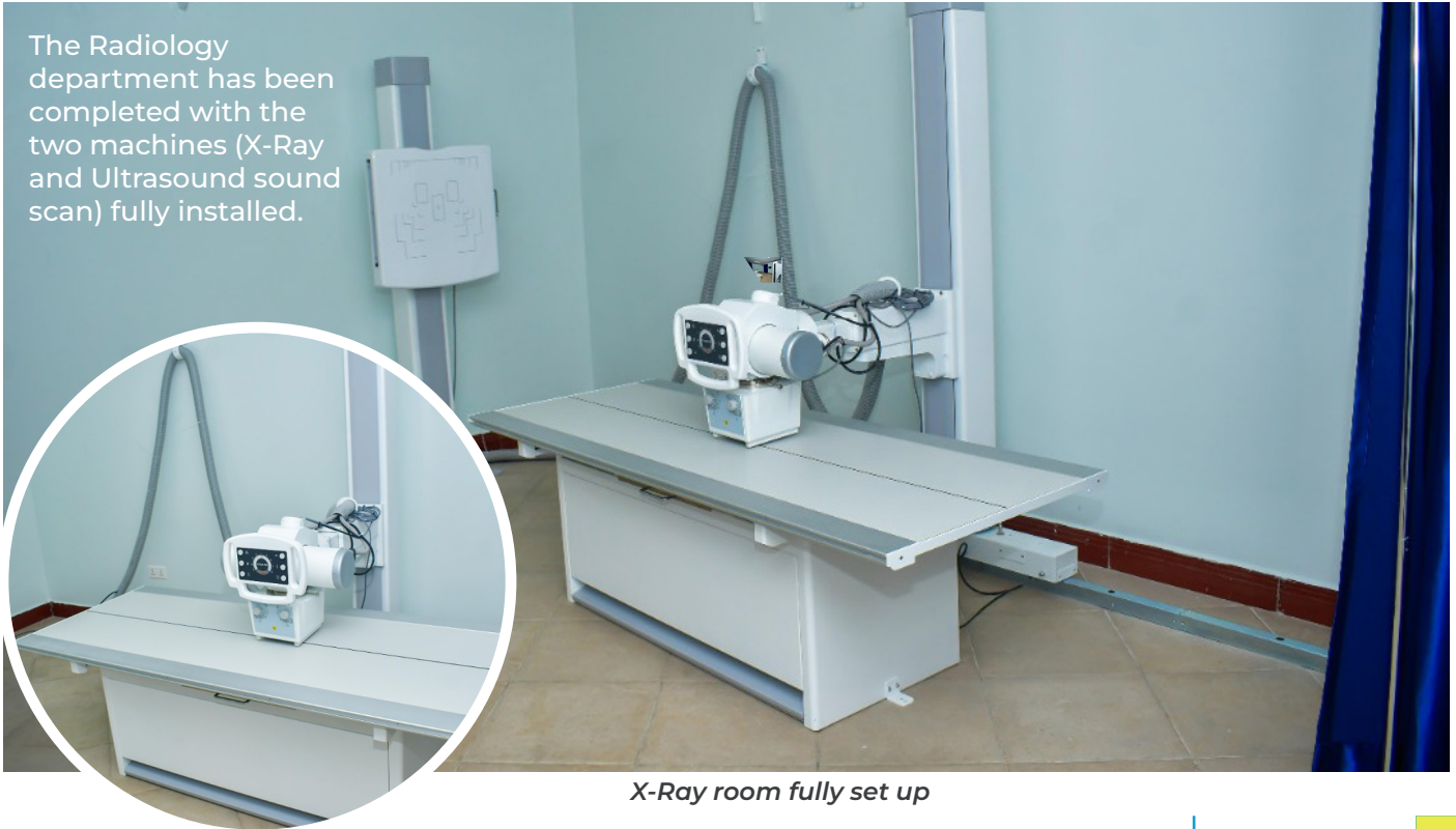
X-Ray room fully set up

The Radiology department has been completed with the two machines (X-Ray and Ultrasound sound scan) fully installed.