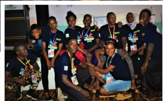
The St Francis team pose for photos during the summit.

We continue to support young people on Saturday through the club. The club supports them with life skills such as communication skills, business skills, computer skills and health information and services which help them to make informed decisions in their day to day lives. The program also addresses issues like HIV stigma, treatment literacy, as well as positive living among YPLHIV