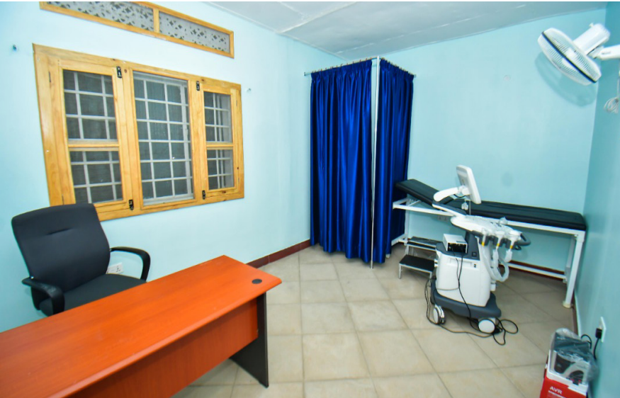
Ultrasound scan room

This machine has a Fuji printer and a separate TV screen is going to be mounted on the wall for the clients to be able to watch their images being scanned while they are resting on their examination couch in real time.