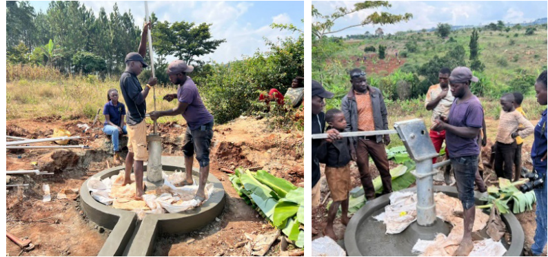
Omoana CRC staff witnessing the drilling process

EWB USA chapter commenced on the works in August of the irrigation project by drilling the bore hole hence completing the first phase of the project. On completion of the borehole, the water was tested and was confirmed suitable for human consumption. It was a temporary measure to enable the community access safe and clean water as we await the next phase of the project which will embark on installation of solar powered irrigation system for the property.