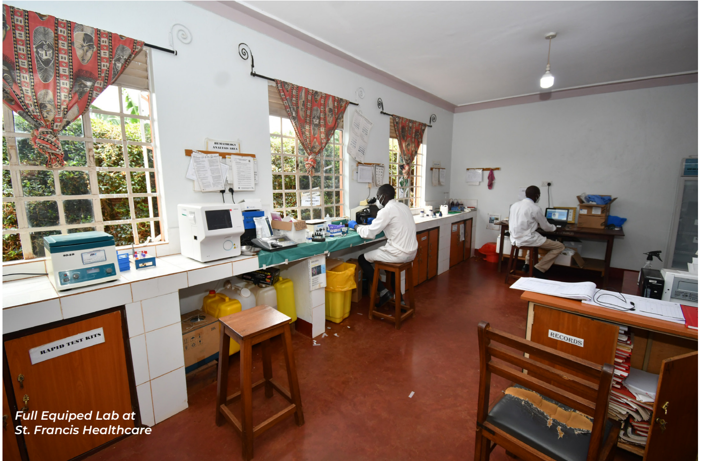
Full Equiped Lab at St. Francis Healthcare